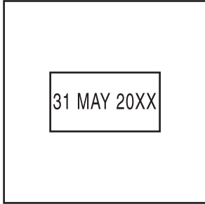
1-1/2" X 1-1/2"