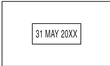
1-1/16" x 1-13/16"