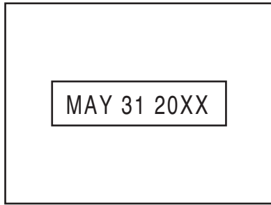
2910-P02 1-1/2" X 2"