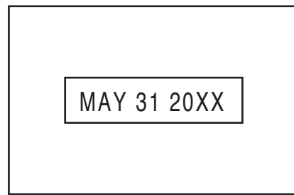
2910-P05 1-3/8" x 2-1/8"