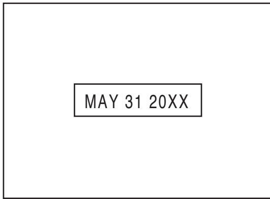
2910-P10 2" X 2-3/4"