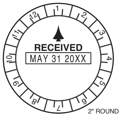
TRODAT 12HR TIME STAMP